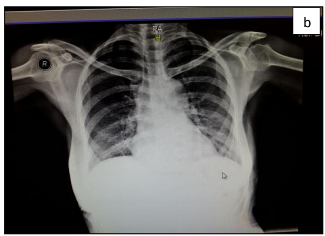
Red arrow- Cardiomegaly; Blue arrow-Blunting of costophrenic angle.